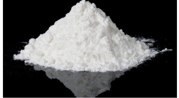
Natural mineral fillers